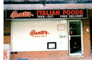
The original Dante's location circa 2004.

So, YES, we are Dante's. The original family and recipes from Baythorn, where it all started over 48 years ago.